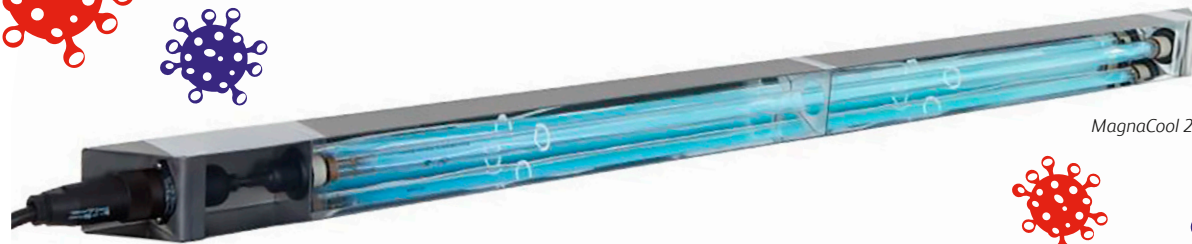
MagnaCool 2800 Supreme - UV System